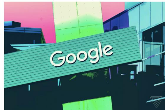
Illustration by Alex Castro / The Verge